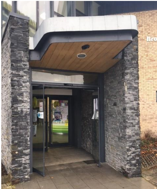
The entrance to the Hub