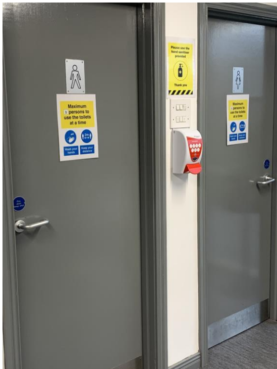
Toilets In reception area

Accessible Toilets with Baby Changing Facilities are behind the Main Hall.