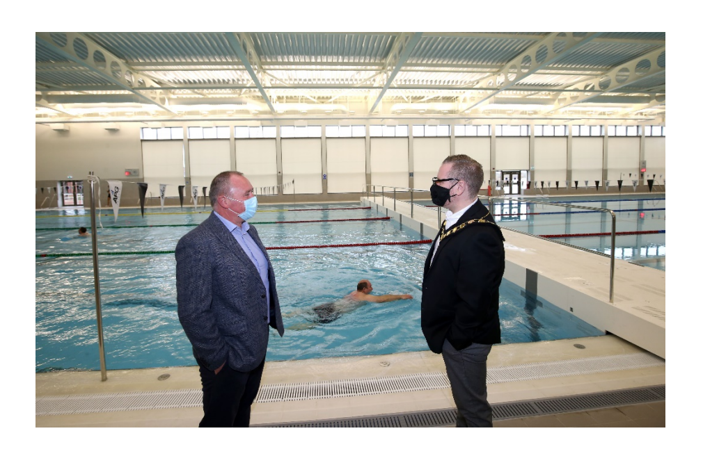
'Inspiring people to make positive changes through great experiences'