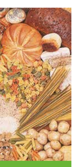
Try to offer something from this group at every meal

This food group includes a wide variety of foods, which are important sources of energy (calories). They also provide essential B vitamins, which are needed for growth and activity. For more information on vitamins, see page 15.