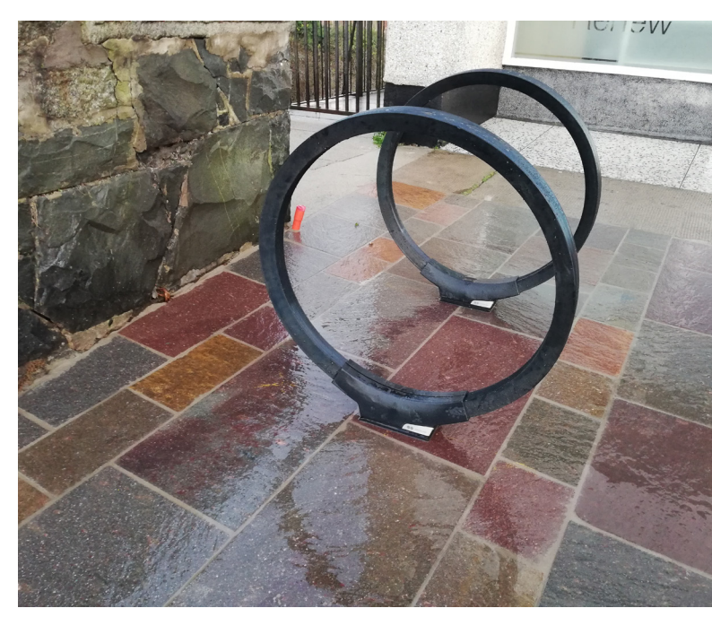
News cycle stands on Bridge Street