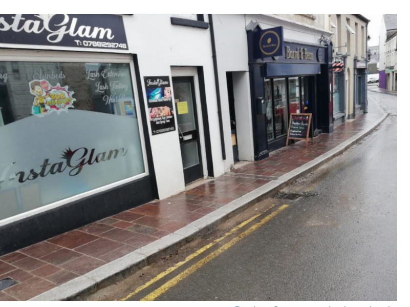
Bridge Street- right hand side