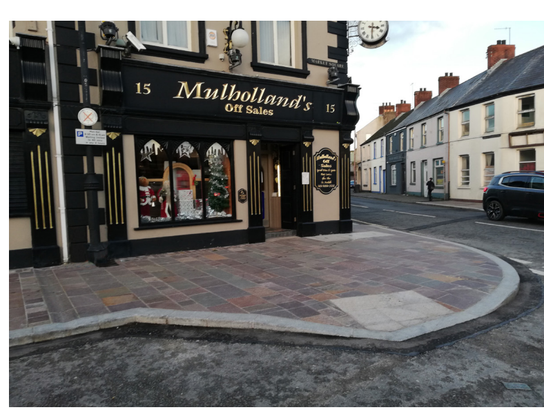
Market Square North junction with Princes Street