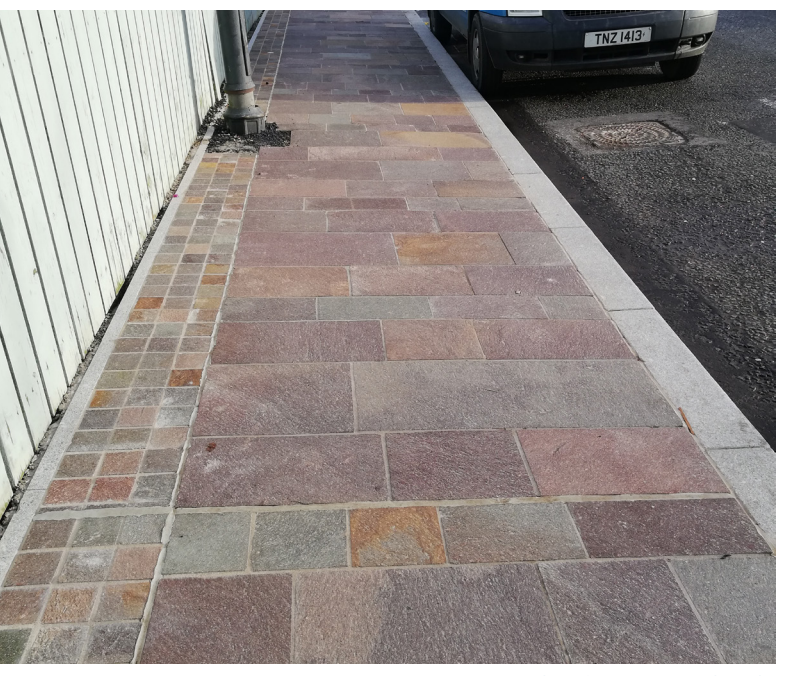
Market Square North side